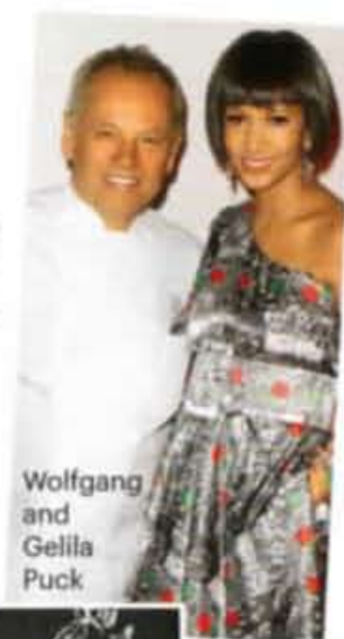
Wolfgang and Gelila Puck

Gelila Puck collaborated with conceptual artist John Baldessari to create the original gown seen here—the perfect attire for the LACMA Art + Film Gala honoring him and Clint Eastwood on November 5.