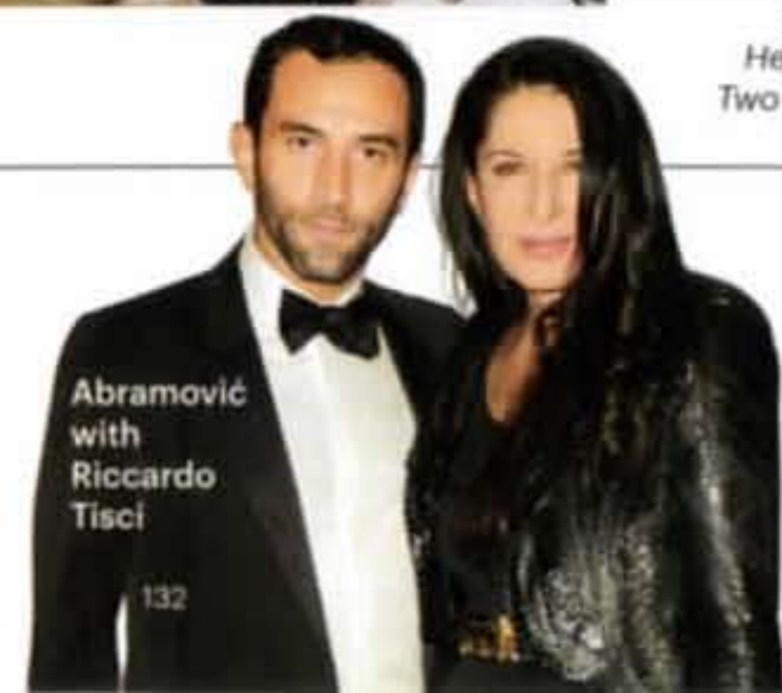
Abramović with Riccardo Tisci

Lou Reed and Metallica team up for the much-anticipated album Lulu , out November 1.